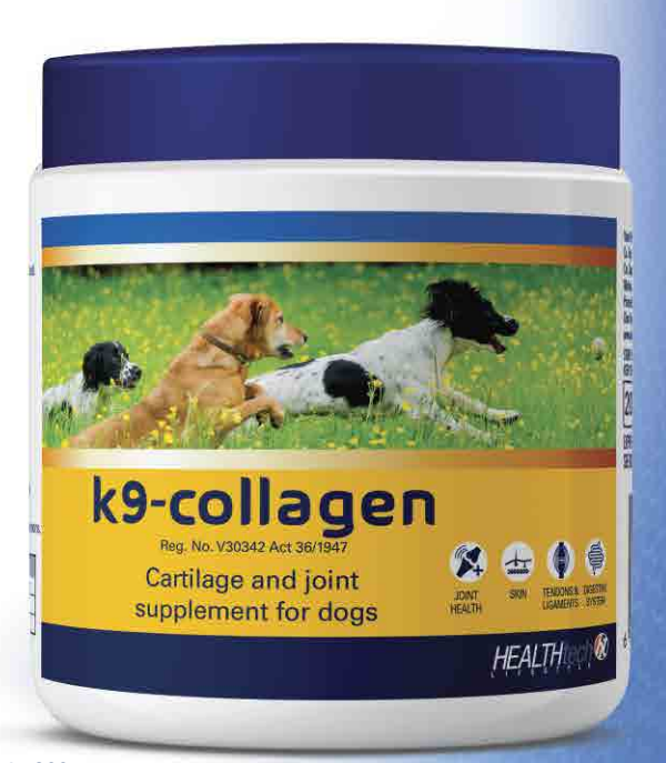
Available in 200 g containers